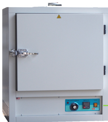
FOV-50 / FOV-100